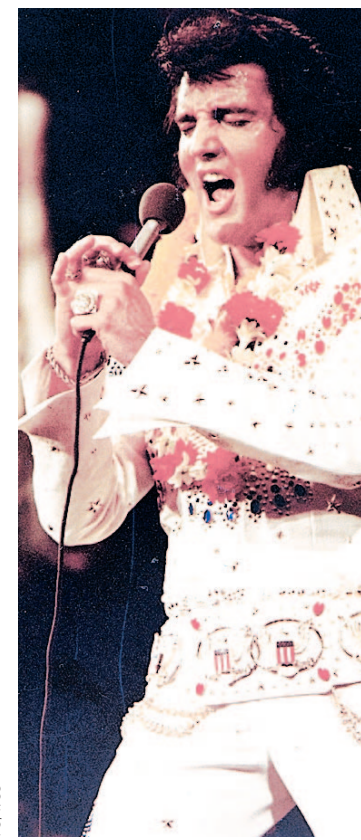
Elvis in Memphis for his 25th anniversary concert. Memphis Mafia called him "Crazy."

37 He performed "Unchained Melody" only during the last six months of his life.