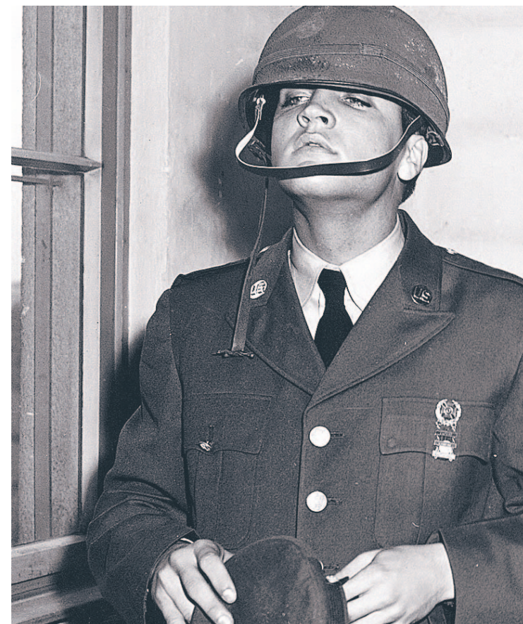
In the Army, the Germans called Elvis the "rock and roll matador."

21 He hated fish, and wouldn't allow Priscilla to eat it at Graceland. 22 Presley preferred to take sponge baths, using a rag and soap. 23 As a teenager, Presley worked as an usher at Loew's State movie theater in Memphis. He was fired when another usher ratted him out