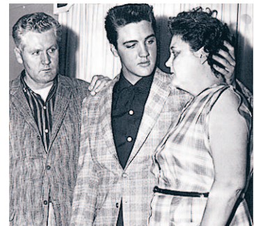
Elvis with his parents, Vernon and Gladys. His first recording was a gift for his mom.

If you're a real Elvis Presley fan, you knew well before the coverage of his upcoming birthday that he would have turned 75 on Friday. The celebration will be marked by tribute concerts, movie marathons, book releases and more, proving that The King is still king. You also probably know that Presley was a twin, that Priscilla was only 14 when she met her future husband and that he liked fried peanut butter and banana sandwiches. Here are 75 things that you may not have known about him.