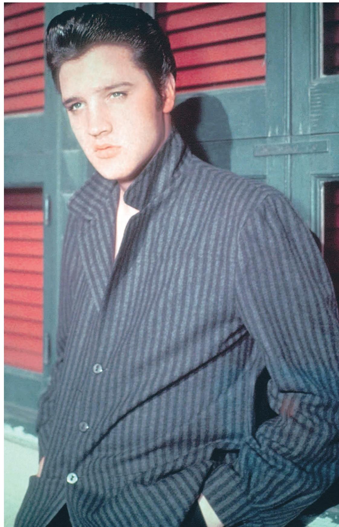
Now, not only his hairdresser knows for sure: Presley used Miss Clairol 51 D, "Black Velvet."

don't want to miss out on going to heaven on a technicality." 17 He also is said to have been partly Scottish, Irish, German, Welsh, Cherokee Indian and French. 18 A tartan was created in 2007 for the 30th anniversary of Presley's death. It contains pink, baby blue, black and gold.